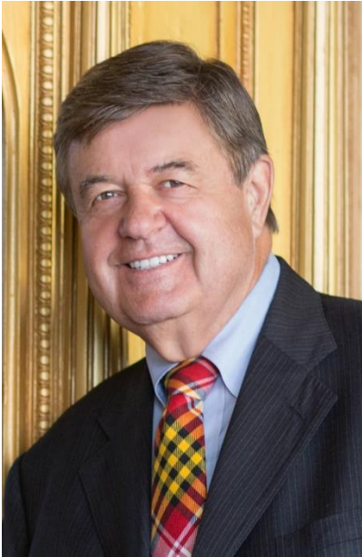
Senator Ron Young- District 3

The 2020 legislative session of the Maryland General Assembly was a historic one. While it was the first session to end early since the Civil War, due to the coronavirus pandemic, we still made significant achievements in education with the passage of the Blueprint for Maryland, and passing emergency legislation to respond to the crisis we now face. Last month, the possibility of reconvening the General Assembly this month was discussed. It has been determined we will not reconvene due to the ongoing pandemic. We'll keep constituents up-to-date at https://www.facebook.com/SenRonYoung/ and www.senatorronyoung.org on important COVID-19 related information as soon as it becomes available to us.