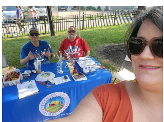
Frederick Dems Happy Hour, 06.14.23