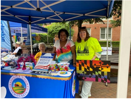
Frederick Dems @ Frederick Pride, 06.24.23