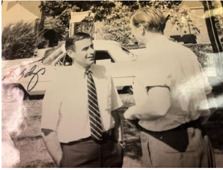
Democratic congressional candidate Goodloe E. Byron campaigning at Staley Park in Frederick in 1970 with Senator Joseph D. Tydings