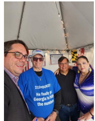
In the Streets