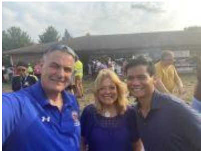
National Night Out – Tuesday, August 6, 2024