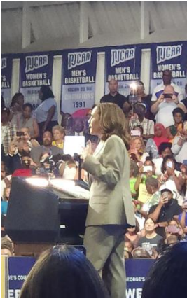
Vice President Kamala Harris, Presidential Candidate