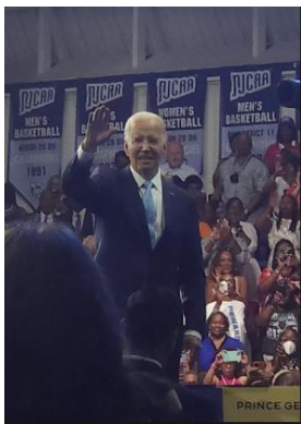
President Joe Biden