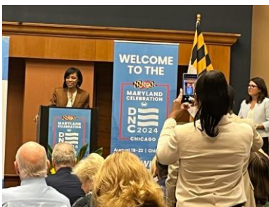
County Executive Angela Alsobrooks, Democratic Candidate for U.S. Senate