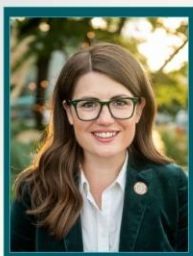
Congresswoman-elect Sarah Elfreth Emerge Maryland Class of 2013

COME AND CELEBRATE SUCCESSFUL MARYLAND WOMEN LEADERS WITH TWO NEW MEMBERS OF CONGRESS!