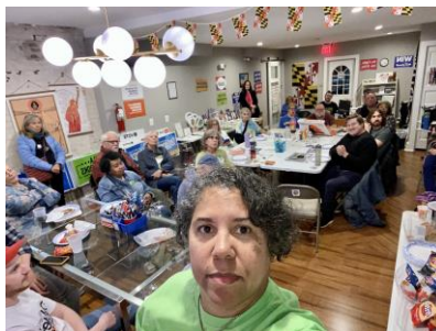
The four pics above are from a Meet & Greet for April McClain Delaney with Special Guest, House Minority Leader Hakeem Jeffries and a separate Meet for April with Gov. Moore, Senator Van Hollen, Minority Whip Clark, & more!