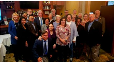
Bottom left: Special Trustee-only Event with Senator Van Hollen, 10.09.24