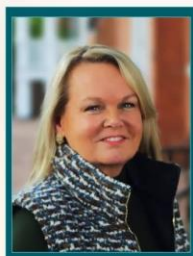
Congresswoman-elect April Delaney