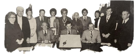
Maryland 1980 Electors

Advisor to the Governor of Maryland, was an unsuccessful candidate for Maryland Attorney General, and served in various other governmental capacities.